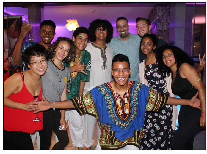
Teens and volunteers at an ACER fundraiser

This sense of confidence in my capability to overcome any challenge and learn an entire new skill is going to complement my future greatly; both within my studies and work in mental health and also in my own personal character. The perspective of having achieved so much this past year has given me hope that anything is possible, as well as ready to take on new challenges.