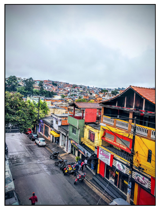
Street view looking out from ACER

In my previous six-month report, I touched upon some of the difficulties in the community of Eldorado in Diadema. Issues such as over-population, substance abuse and violent behaviours greatly impact the children on a daily basis. After a further six months, it became apparent that the struggles run deeper still. My proficiency in Portuguese and living in the community of Eldorado allowed me to see the vast class and race divide within the city of São Paulo; many areas within the city feel truly worlds apart. 50.7% of the population of Brazil define themselves as black or mixed race, yet statistics show that on average, White Brazilians earn double to that of Black Brazilians and within the centre of the city, less than 20% identify as black or mixed race. In Brazil's history, inequality and racism was a result of Portuguese colonisers enslaving an estimated 4.9 million Indigenous and Africans Brazilians, and the systemic racial inequality in society is still heavily apparent.