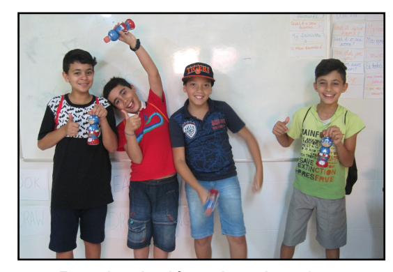
Regular 'Inglés e Artes' students

As a result of these challenges, I found myself looking closely at the intended learning outcomes within my sessions and hoped to incorporate ways to work on these issues. I continued to lead engaging sessions to encourage creativity and equality within an educative environment. Over the year, Articulate was relocated to a new classroom, a space solely for our projects which allowed us to freely decorate and structure the space.