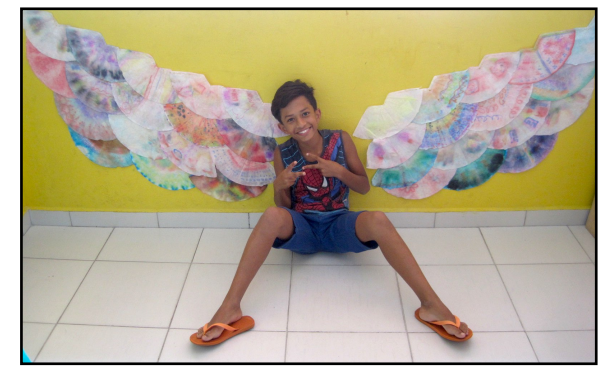
Mural made from the children's art

In addition, we held exhibition showcases of the artwork made in 'Clube de Artes' both within ACER and within St Pauls, an exclusive independent school and supporter of ACER, based in the city. By doing so, the children proudly saw their favourite pieces enjoyed by others and I hoped to raise awareness of both the impact and benefits of art making. Exhibiting the work in St Pauls was also to encourage a dialogue between the two groups and to celebrate the skills and creativity of our young people. By increasing communication, I hoped to challenge social bias.