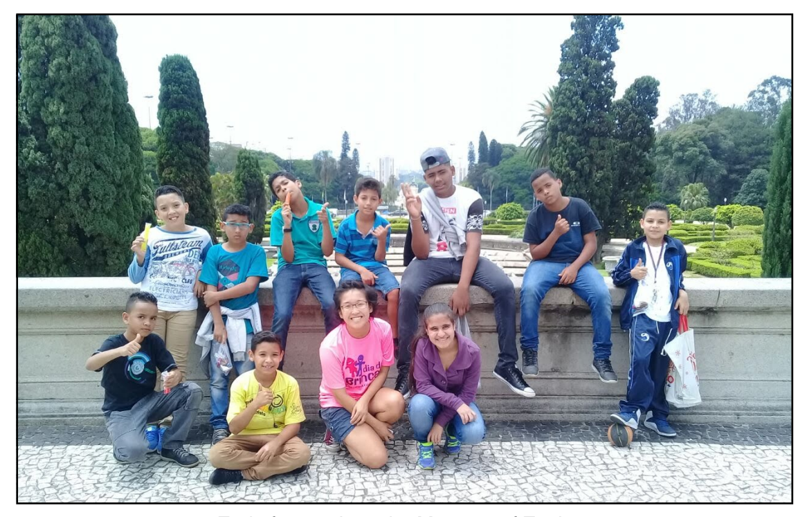
End of year trip to the Museum of Zoology