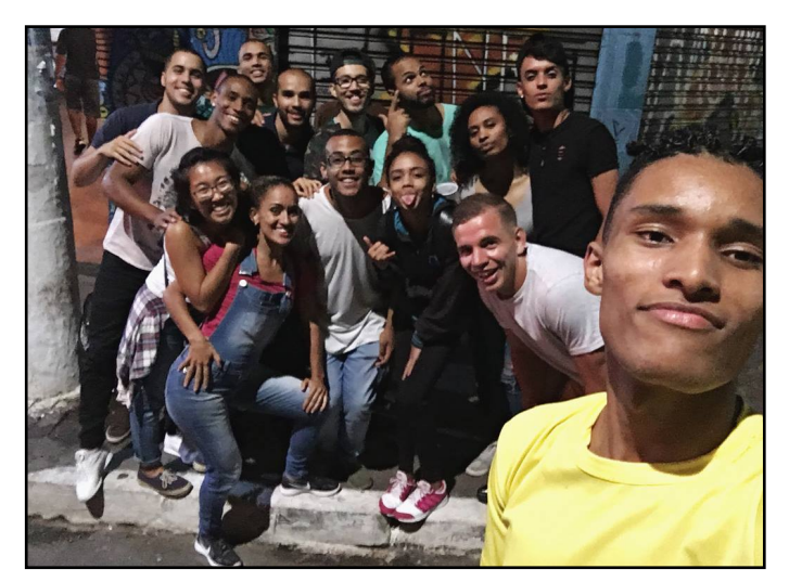
My leaving gathering with colleagues and friends